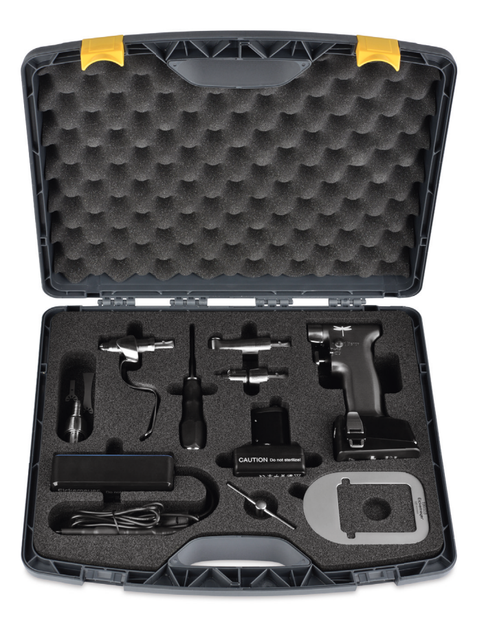
Scope of delivery